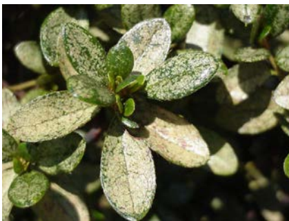
Damage to azalea by azalea lacebug.

A: A few rhododendrons seem to be particularly susceptible to the ravages of rhododendron lacebug ( Stephanitis rhododendri ), a relative of andromeda lacebug, a similar, but more common species found infesting Pieris formosa var. forrestii and its hybrids. Lacebugs, so named because of their flattened lacy wings, are aphid-like insects that feed by piercing and sucking phloem (sap) from the midrib and larger veins on the lower surface of leaves. Red-brown blobs of excreta are deposited on the under surface, while the upper surface appears blotchy and speckled, as whole groups of cells die off. Birds and other predators are probably put off by the sticky excreta. Insecticidal soap and summer oil sprays may be effective, but spraying is difficult because it has to be directed at the undersides of the leaves. Locally, lacebugs of all sorts appear to prefer a dry atmosphere. Infestations are most often found on plants close to buildings, under overhangs or under large conifers, such as Thuja plicata .