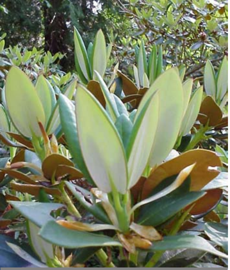
Rhododendron campanulatum

of R. recurvoides? I find it subtle and fleeting compared with the former species, but it does make an impression. No matter; it also has beautiful, narrow leaves with veritable mattresses of lower surface indumentum and masses of glands on both leaves and stems. These glands are probably responsible