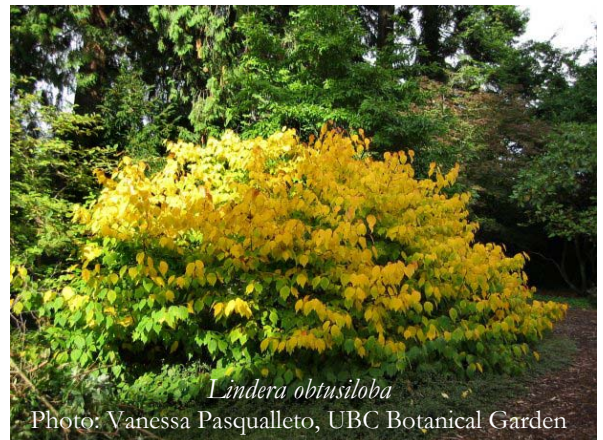
Lindera obtusiloba

As temperatures fall inexorably toward the freezing mark at this time of year—though after the last few winters, one wonders if we'll actually get much below that—there are obvious signs of decline and decay. However, in the David C. Lam Asian Garden, the spectacular yellowing of Lindera obtusiloba (broadleaf spicebush) and the ripening of the fruit of Decaisnea fargesii (dead man's fingers) are a signal that autumn can be a colourful end to the season. Both are large shrubs, the lindera occasionally making a sprawling tree, and the two are worth making room for in the woodland garden. Many other plants are notable at this time, including Disanthus cercidifolius (disanthus), with its almost unbelievably rich fall colour, Camellia sasanqua in full flower, Sorbus species packed with berries, and rhododendrons. For example, R. thomsonii and R. hanceanum are throwing precocious blooms, as is their habit. The climbing aconites are still in flower (they were featured in the October Indumentum ), but more on climbing plants later.