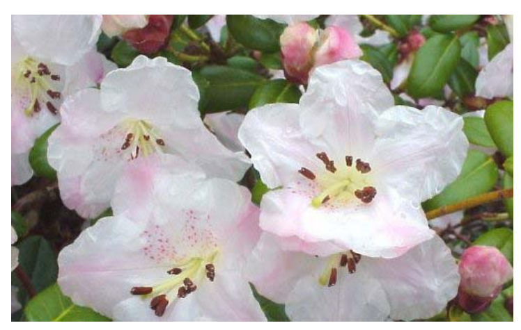
Rhododendron moupinense