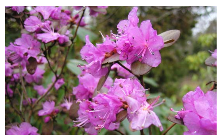
Rhododendron dauricum (Darts Hill Garden)