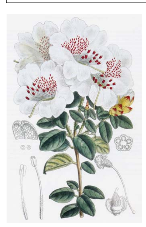
Rhododendron moupinense adapted from an illustration by Matilda Smith (1909) from Curtis's Botanical Magazine

What makes a good rhododendron? Small growing with a compact habit? Clean, glossy foliage? Drought and sun tolerant, and hardy to –17C? Large, showy, fragrant flowers? Rhododendron moupinense sounds pretty good, eh? Well, it is, and it deserves to be better known and more widely grown.