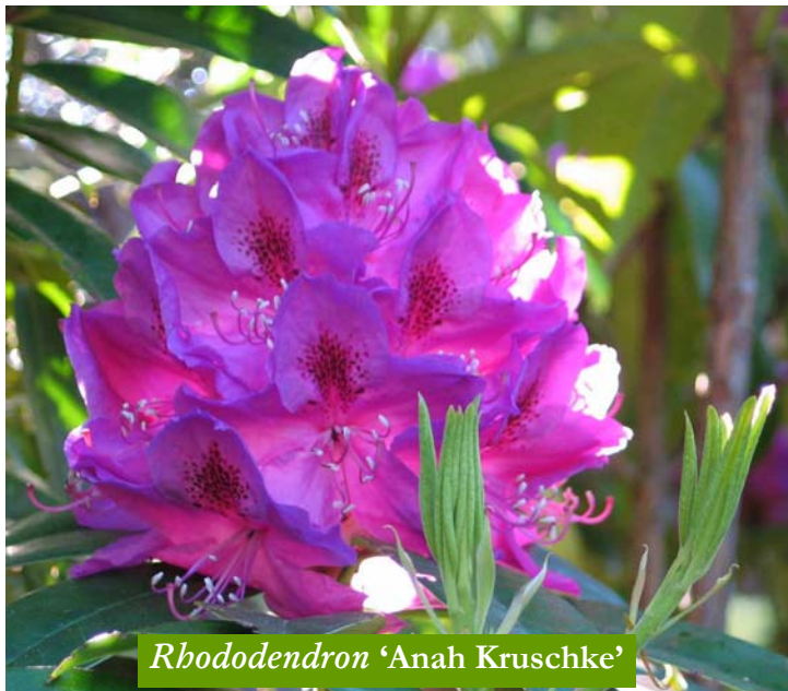
Rhododendron 'Anah Kruschke'

After taking a number of shots of a certain rhododendron using various exposure settings, I can play back each of the images on the screen and erase all but the best one. I can also plug the camera directly into my television set, see the photographs on the large screen, and hear the name of each rhododendron come through my stereo system. As an alternative, I can use a USB cable to connect the camera to my computer to download, view, and modify the photographs using Photoshop Elements. Photographs that I choose to print on 8½" × 11" photo paper are reproduced on my inkjet printer with professional-looking results.