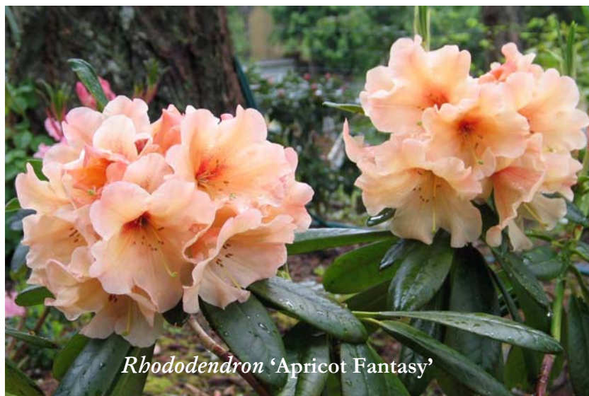
Rhododendron 'Apricot Fantasy'

I've included a few sample photographs with this article, taken in my Pender Harbour garden this spring, in early morning light, at very low aperture settings. All have been cropped and resized in Photoshop Elements, but none has