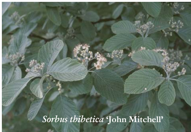
Sorbus thibetica 'John Mitchell'

There are basically two kinds of Sorbus : those with pinnately compound leaves (mountain ashes) and those with simple leaves (whitebeams). For most people in the Vancouver area, "mountain ash" is the European S. aucuparia (rowan or European mountain ash). This is unfortunate, not because these are inferior trees (there are many excellent cultivars), but because we have our own superb native S. sitchensis (Sitka mountain ash)