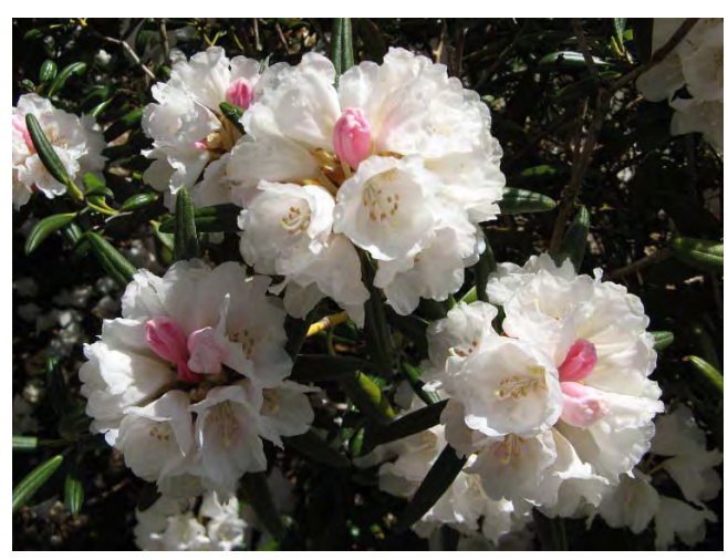
R yakushimanum ... Van Dusen

The Public Education Committee of the ARS has asked chapters to compile lists of the best performing rhododendrons in their areas. The lists give plants with good form, foliage and flowers that are hardy and resistant to pests and diseases for the given area. The listed plants have proven their ability to perform well in members' gardens and are recommended to others. The following