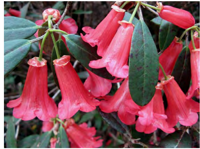
R sanguineum ssp sanguineum var cloiophorum